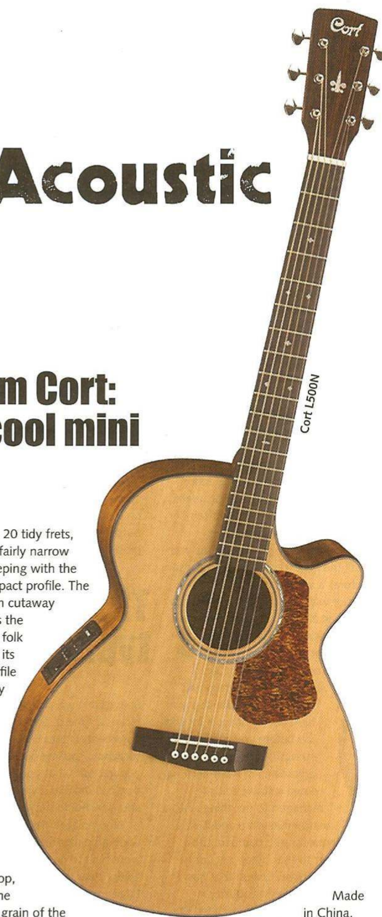
Made in China, the L500

Whilst a small bodied acoustic isn't designed to produce the same mighty output as a full-sized jumbo or dreadnought, compact acoustic guitars generally have a more delicate voice alongside fairly decent projection. The Fingerstyle