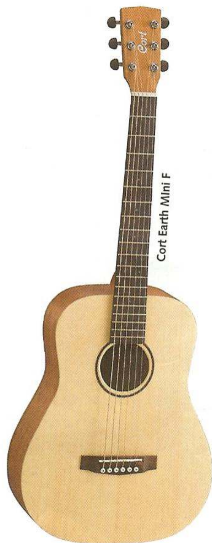
Cort Earth Mini F

HC Distribution make the bold claim that they give each and every Cort guitar a thorough inspection and set up before onward shipping to the stores, and it's a thumbs up from me, as the playability on both these guitars matches their convincing build quality and great tones. PM