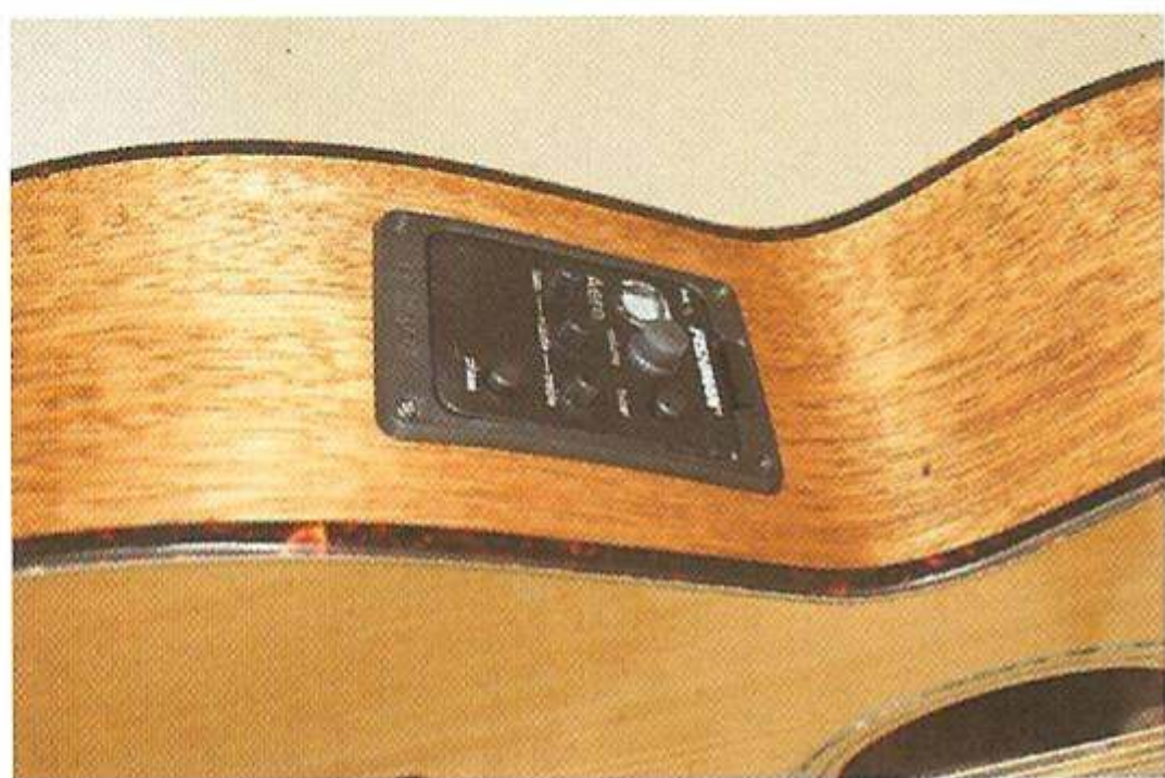
Aero-dynamic: The Fishman aero is linked to a Sonicore transducer pickup

whilst retaining lower note definition without any boom or mush even when the low end was boosted with the EQ. Needless to say, the warmth and separation are crystal clear without any brash overtones.